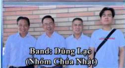
Band: Dũng Lạc (Nhóm Chúa Nhật)