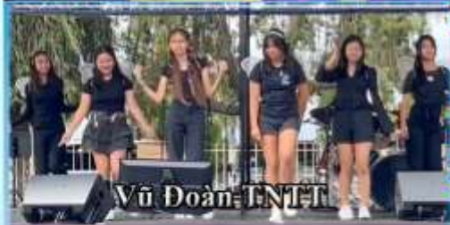
Vũ Đoàn TNTT