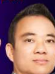
Ca Sĩ Huỳnh Đức