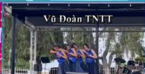
Vũ Đoàn TNTT