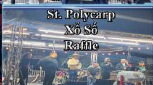
St. Polycarp Xổ Số Raffle