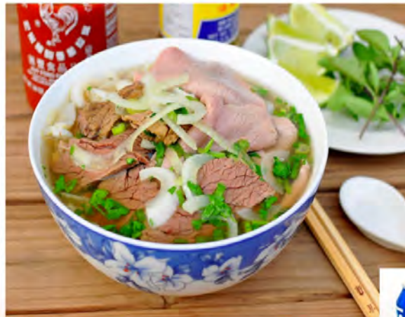
Beef Noodles Soup